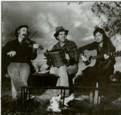
The Savoy-Doucet Cajun Band