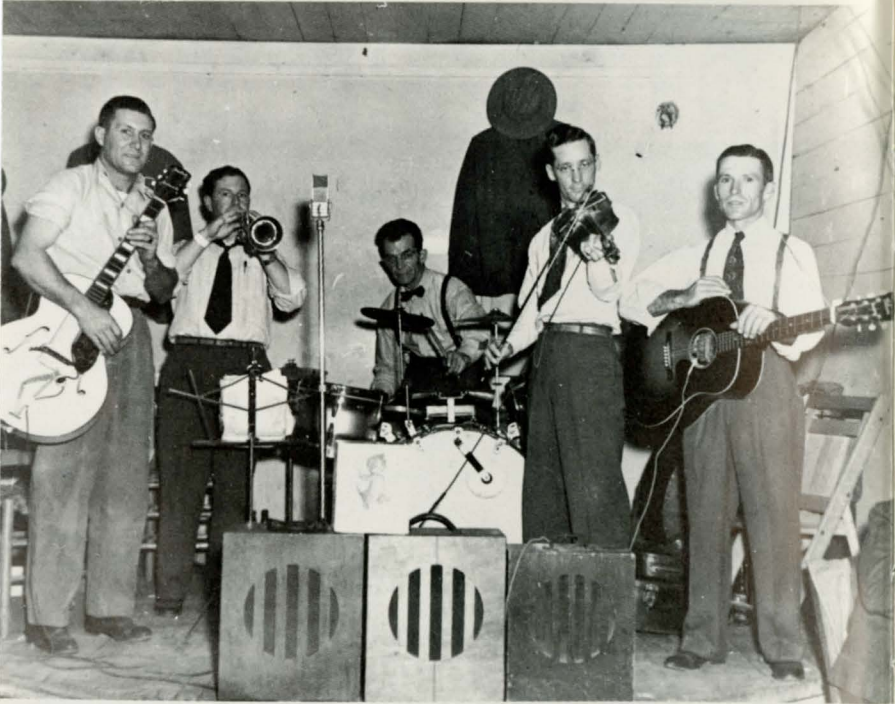
The Hackberry Ramblers, late 1940s.