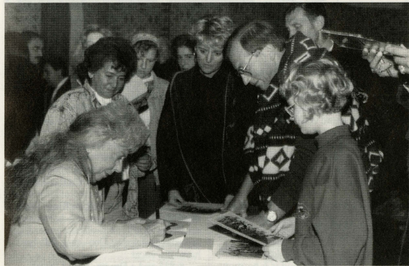
Rose Maddox signing autographs after concert in St. Poelten, Austria, 10/26/1993.