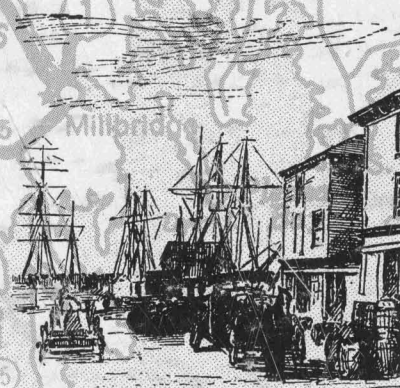
MASTER MARINERS' ASS'N