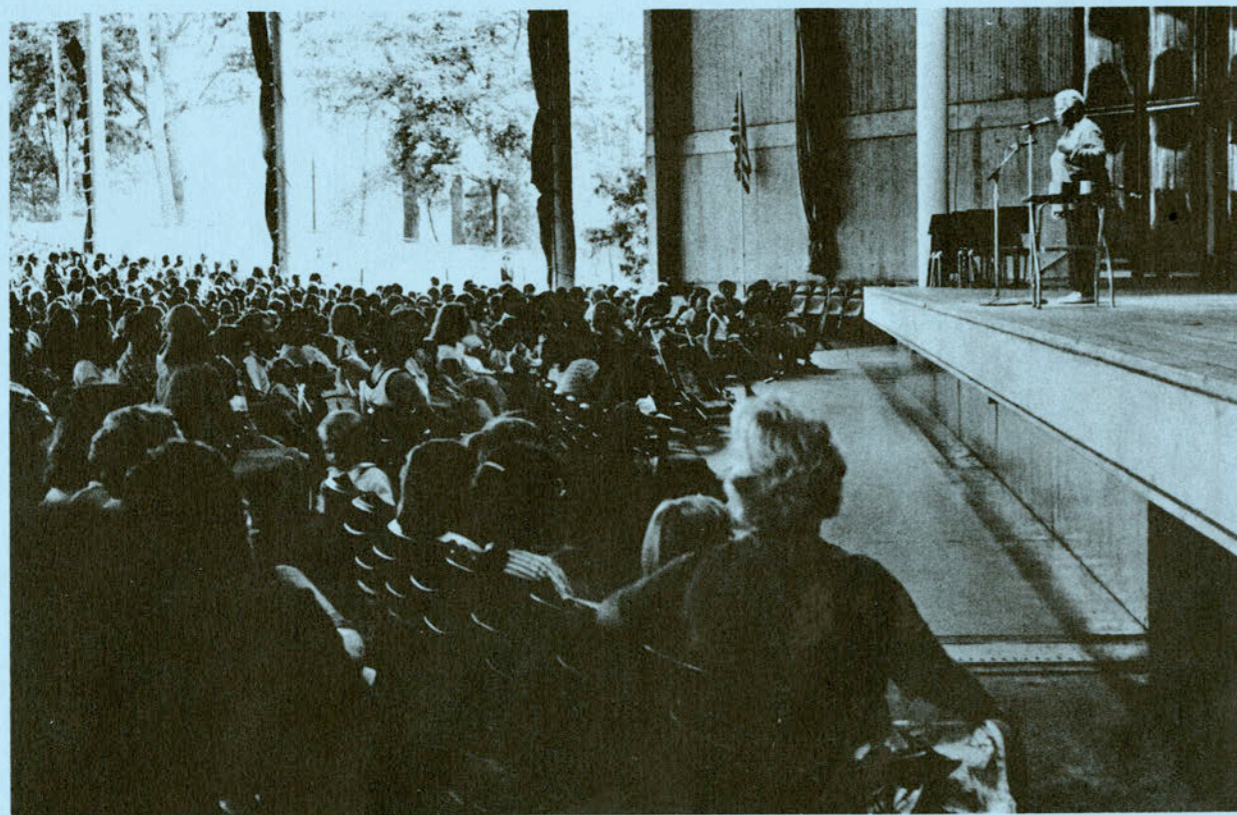
ELLA'S FIFTHTEENTH YEAR AT THE RAVINIA FESTIVAL AUG. 23, 1983, HIGHLAND PARK, ILLINOIS

In my HOPPING AROUND FROM PLACE TO PLACE I have also traveled to six continents of the world: AFRICA, NORTH AMERICA, SOUTH AMERICA, AUSTRALIA, ASIA and EUROPE. My next big travel ADVENTURE, hopefully, will be the ANTARTICA, completing the SEVEN CONTINENTS . . . Ella Jenkins