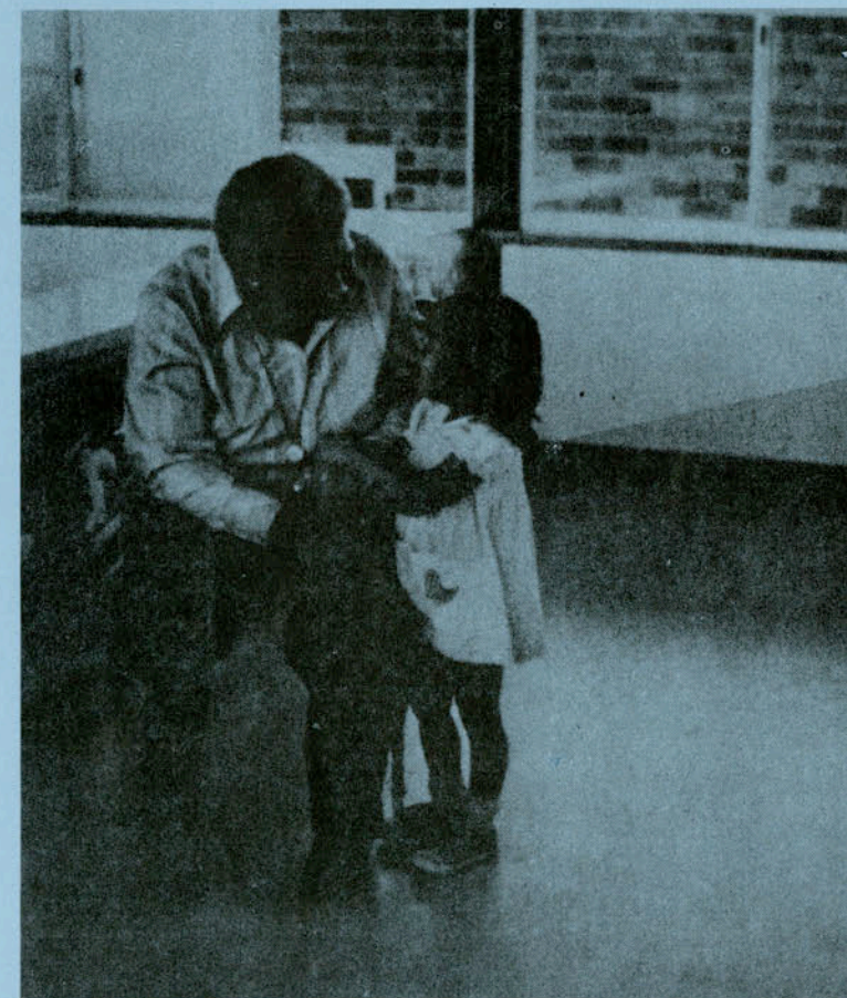
MAKING FRIENDS WITH AN ABORIGINAL CHILD