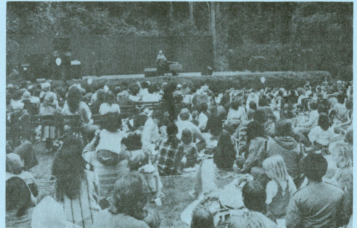
ELLA'S MAY, 1983 CONCERT AT STERN GROVE PARK, SAN FRANCISCO