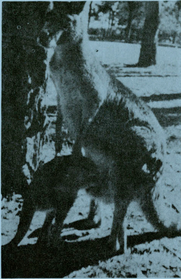
BABY KANGAROO GOING INTO ITS MOTHER'S POUCH