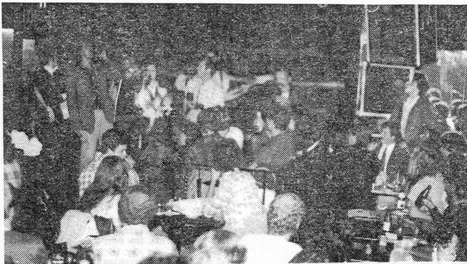
Opening night's crowd at Speak Easy

All this put together makes for a very impressive cooperative effort now in its fifth month. New exciting ideas are currently in the works, of which this musical magazine is but one.