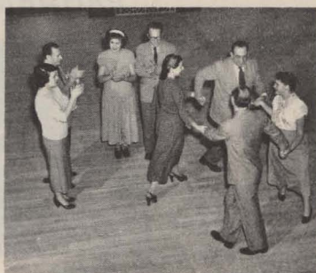
circle up four