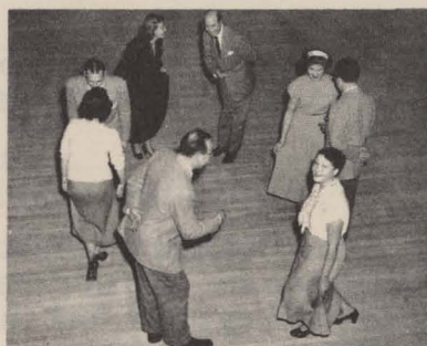
Bow or Honor