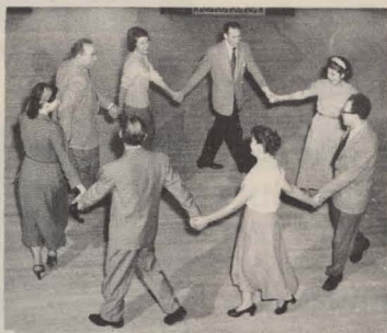
all join hands and circle

DAVE MILLER HOME TOWN FROLICS WAAT AND WATV