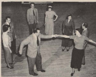
step right back