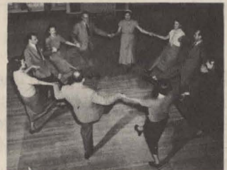
put your right foot in