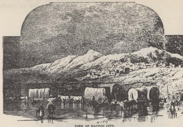
VIEW OF NAUVOO CITY.

DRIVEN FROM THEIR HOMES BY PERSECUTION AND VIOLENCE, THE MORMONS BEGAN THEIR HISTORIC TREK WESTWARD TO SEEK A NEW "ZION" UNDER THEIR NEWLY-ELECTED LEADER, BRIGHAM YOUNG. THE EXHORTATION TO FLEE "TO THE MOUNTAINS OF EPHRAIM" AND THE PROMISE OF A "HAVEN OF SAFETY IN ZION" ARE ELOQUENTLY PRESENTED IN THE SONG, "OH BABYLON, OH BABYLON!" (11, NO. 1). THE JOURNEY WAS FILLED WITH PHYSICAL HARDSHIP AND SUFFERING. MANY DIED ALONG THE WAY. AT ONE TIME WHEN THE DISCOURAGEMENT OF THE PEOPLE HAD REACHED THE POINT OF DESPAIR AND HOPELESSNESS, BRIGHAM YOUNG ASKED WILLIAM CLAYTON TO WRITE A HYMN TO RALLY THEIR SPIRIT. WITHIN A COUPLE HOURS CLAYTON WROTE AND PRESENTED TO HIS LEADER "COME, COME YE SAINTS", (11, NO. 2), A HYMN WHICH HAS BECOME THE THEME OF THE CHURCH OF JESUS CHRIST OF LATTER-DAY SAINTS. IT MAY BE HEARD ON THE SUNDAY RADIO BROADCASTS OF THE MORMON CHOIR FROM THE TABERNACLE IN SALT LAKE CITY. ITS SOLACING REFRAIN, "ALL IS WELL", RENEWED AND SUSTAINED THE FAITH OF THESE COURAGEOUS PIONEERS ON THEIR RUGGED JOURNEY.