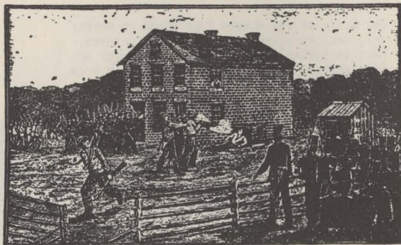
THE ASSASSINATION OF JOSEPH SMITH.