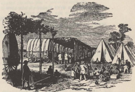
MORMON TABERNACLE CAMP ON THEIR ARRIVAL IN UTAH.

FOR WE DO KNOW IT WILL BE SO, GOD'S SERVANTS SPOKE IT LONG AGO. WE SAY IT IS HIGH TIME TO START TO CROSS THE PLAINS WITH YOUR HAND CART.