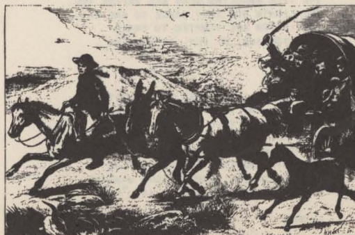
A MORMON FAMILY DRIVING TO CONFERENCE MEETING.