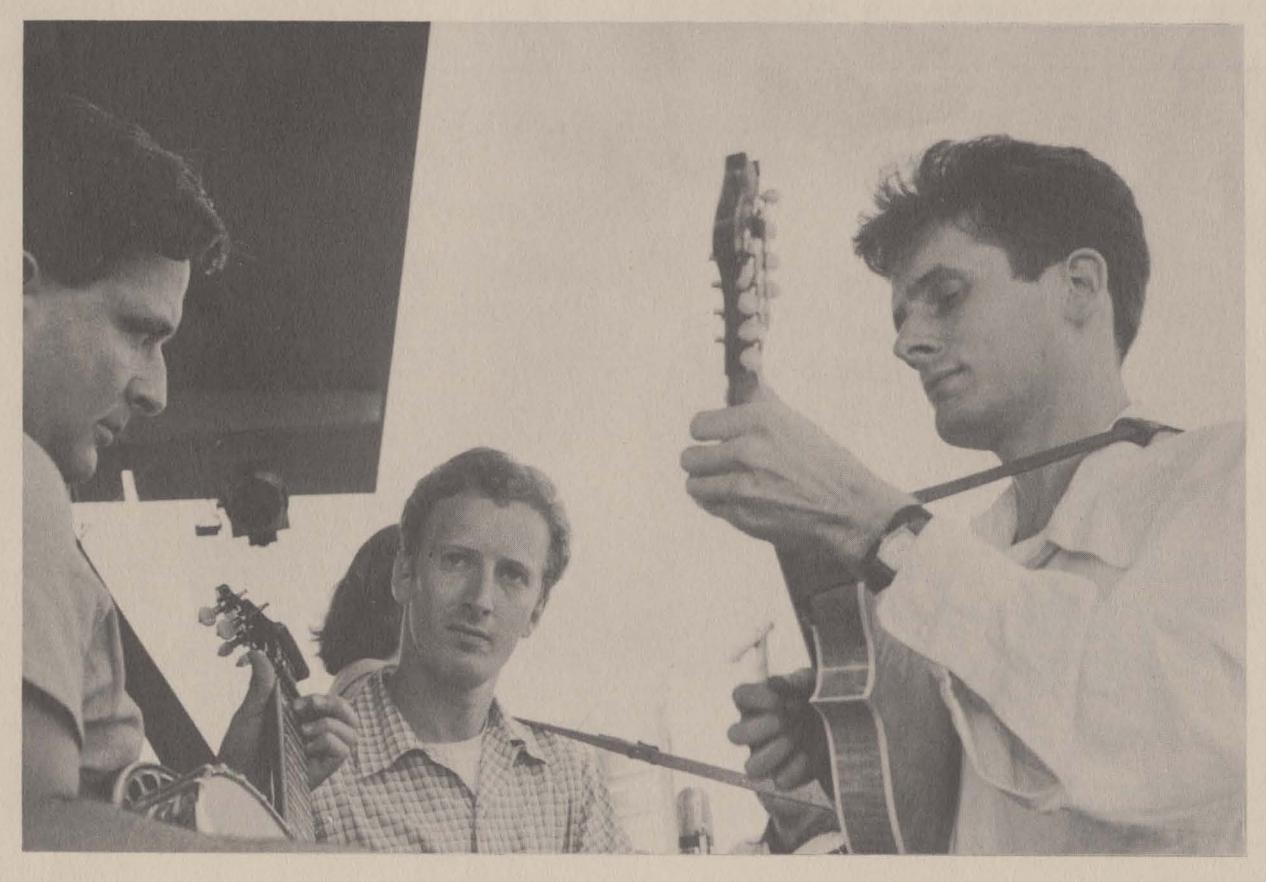
The New Lost City Ramblers

The music of this transition period then vanished -preserved only on some Library of Congress discs the old 78 rpm records, most of them rare collectors' items. The New Lost City Ramblers discovered (or re-discovered) this music and have popularized it throughout the country among city folk-singers who have taken it to their hearts (and guitars) with a marvelous enthusiasm.