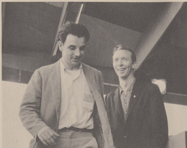
Patrick Clancy with Tommy Makem

Patrick Clancy, not so many years off the boat from Ireland, is keeping alive the wonderful tradition of Irish folk music. His unaccompanied rendition of the haunting Napoleonic ballad, "Bonnie Bunch O' Roses-O" is left over from the 1959 Festival -- and a gem it is!