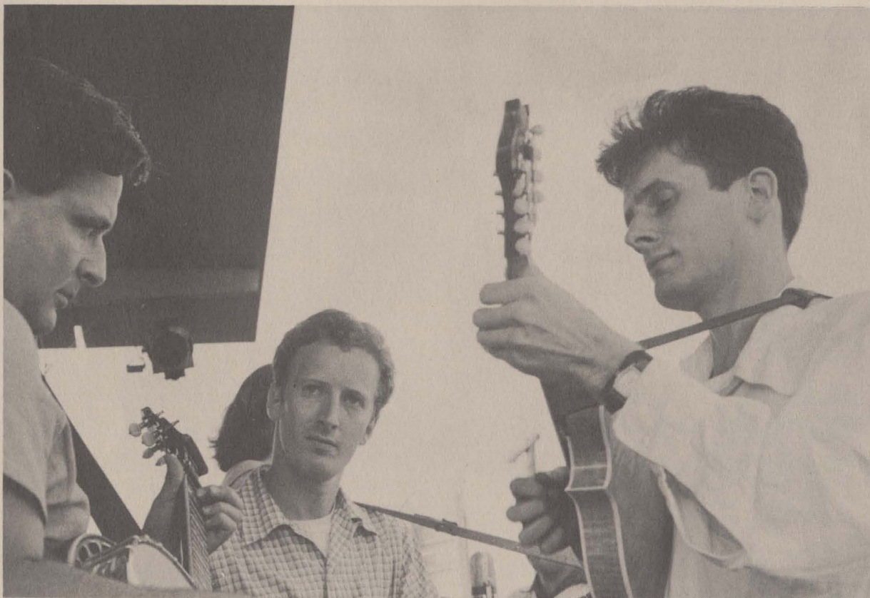
The New Lost City Ramblers

The music of this transition period then vanished -- preserved only on some Library of Congress discs the old 78 rpm records, most of them rare collectors' items. The New Lost City Ramblers discovered (or re-discovered) this music and have popularized it throughout the country among city folk-singers who have taken it to their hearts (and guitars) with a marvelous enthusiasm.