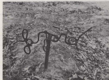
HEAD MARKER OF GRAVE IN BURYING GROUND OF OLD OAK GROVE BAPTIST CHURCH, NEAR OSBORN CROSS ROAD, PERRY COUNTY