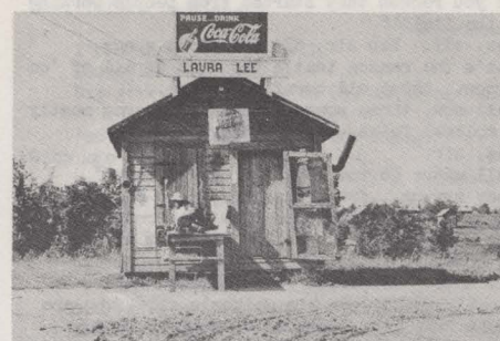
ROADSIDE JUKE NEAR PERRY-HALE COUNTY LINE, ALABAMA. DESERTED ALL WEEK LONG, JUKES LIKE THE "LAURA LEE" BLARE UP WITH SONG AND DANCE ON SATURDAY NIGHTS.

This here hammer (wham!) killed John Henry (heunhh!) Killed him dead, baby (wham!), killed him dead (heunhh!) This here hammer (heunhh!), killed John Henry (heunhh!) Killed him dead (heunhh!), killed him dead (heunhh!) I been drivin' (heunhh!) hammer from my shoulder (heunhh!) All day long (heunhh!), all day long (heunhh!) (Come on man, come on) I been drivin' (heunhh!), hammer from my shoulder (heunhh!) All day long (heunhh!), all day long, (heunhh!) (Come on man, come on!) Lord, I b'lieve I (heunhh!) 'near 'bout dynin' (heunhh!) In my arm (heunhh!), in my arm (heunhh!) (Tell the truth!) in my arm (heunhh!) Lord, I b'lieve I'm (heunhh!) 'near 'bout dynin' (heunhh!)