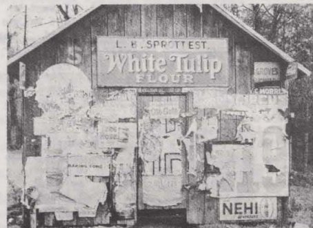
SIDE OF SHED, SPROTT, ALABAMA "ILEFT HOME....FROM MY OWN NAME."