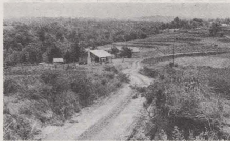
PATCHES OF FARM LAND UNDER CULTIVATION IN HILLS OF TALLADEGA NATIONAL FOREST, OAKMULGEE DIVI- SION, ALA.