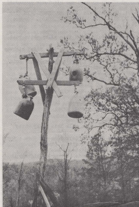
JUGS, HAND SHAPED OF CLAY FROM NEARBY CREEK BEDS, MAKE NESTS FOR MARTINS WHEN CUT OPEN ON THE SIDE AND STRUNG UP ON POLES. MARTINS BRING GOOD LUCK ANYWHERE IN ALABAMA, AND MOST PEOPLE MAKE HOMES OF GOURDS FOR THEM. IN THE TALLADEGA FOREST, JUGS DO JUST AS WELL.

Band 3: Selection 3: TAKE THIS HAMMER. (Source: MC 3-3) Recorded near Cahaba River, April 10, 1954.