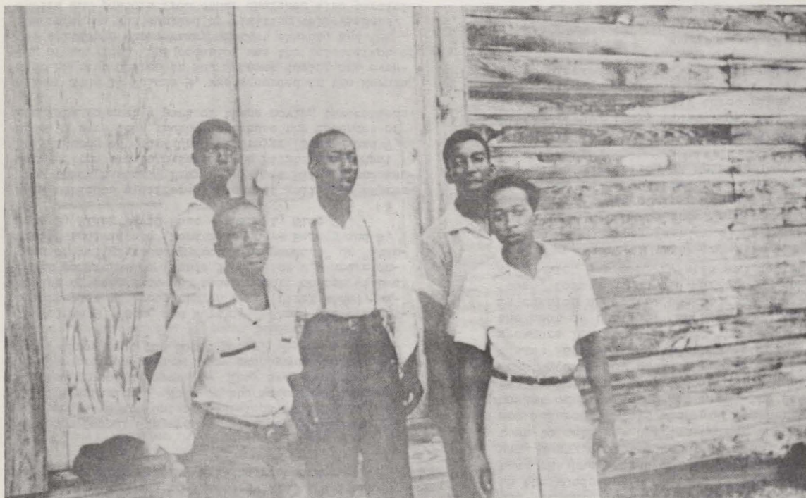
STARLIGHT GOSPEL SINGERS