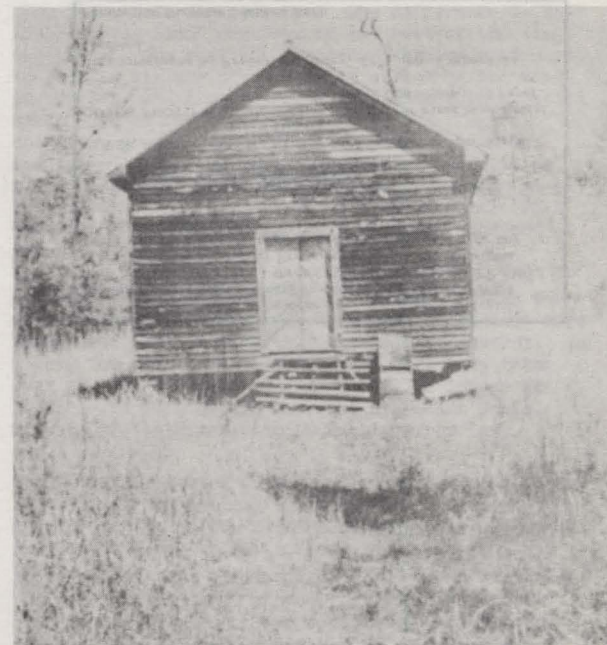
EXTERIOR - HOLINESS CHURCH IN TALLADEGA FOREST