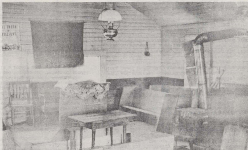
INTERIOR OF CHURCH, ABOVE