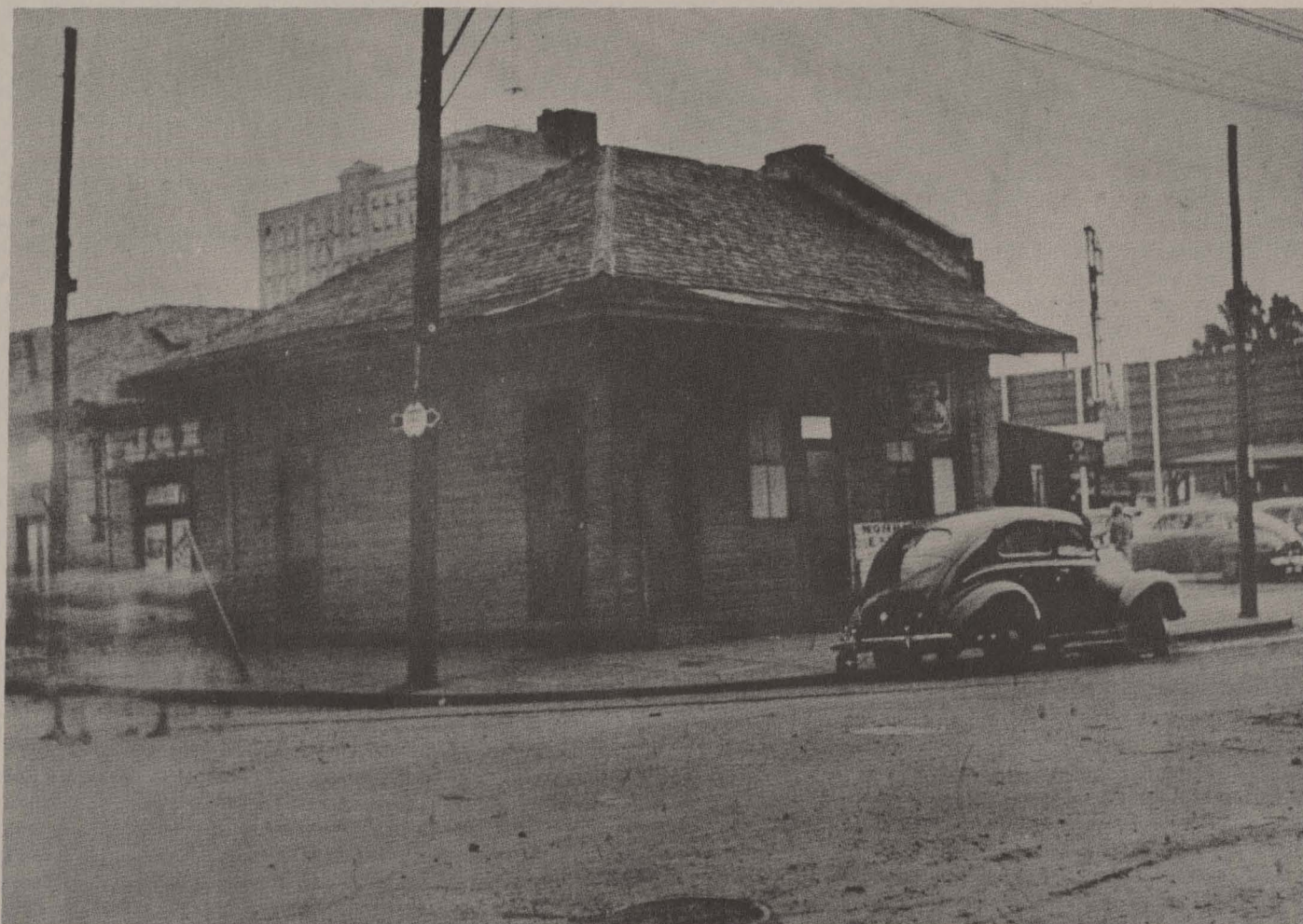
LALA'S CABARET - New Orleans, La.