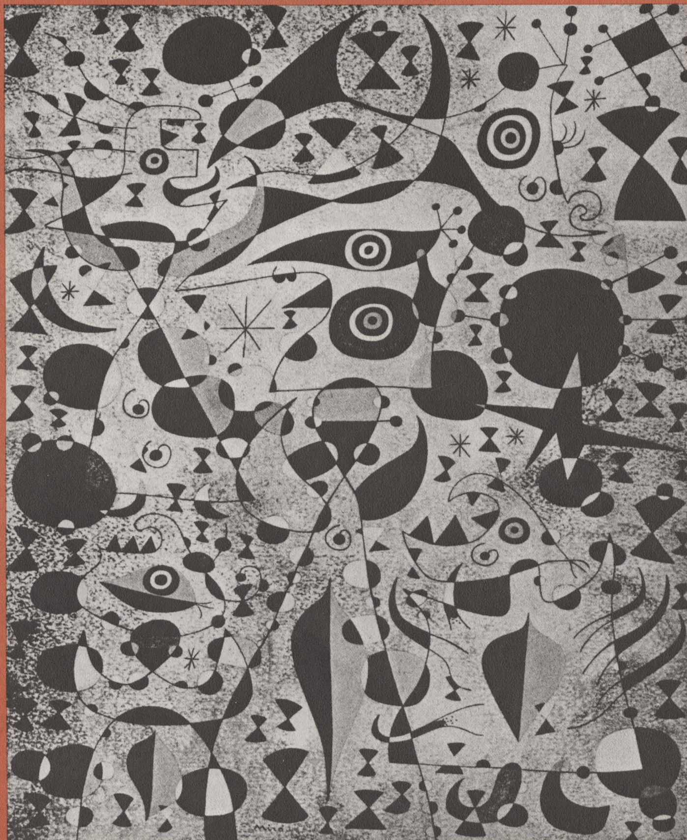
WOMEN ENCIRCLED BY THE FLIGHT OF A BIRD, 1940, BY JOAN MIRO