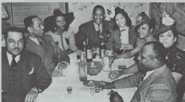
Mary Lou Williams, 3rd from left—Andy Kirk to her right—Pha Terrell, the band's vocalist, to her left.