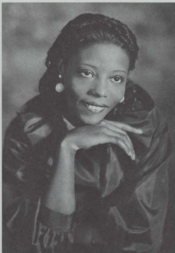
Mary Lou Williams—Publicity Still—1930's.