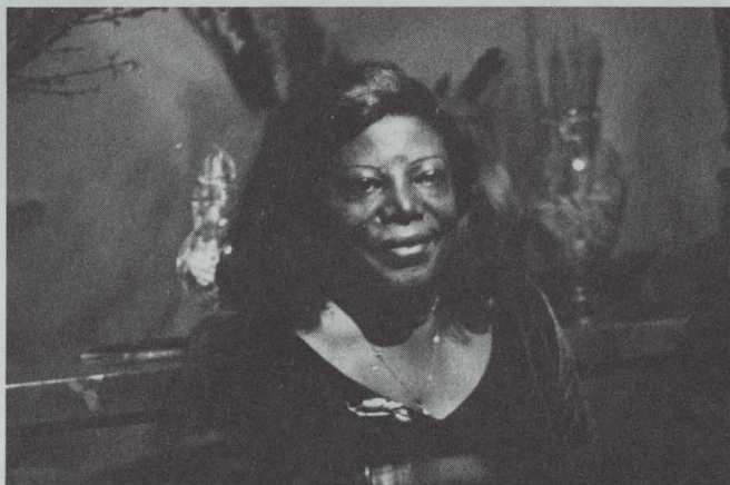
Mary Lou Williams at the Cookery, N.Y.C.—1972.

Mary Lou Williams recorded this narration and this music tracing the history of Jazz in her apartment in New York City in late 1970. She wrote the narration and recorded herself using her Tandberg tape recorder. She then turned to her Hamilton (Baldwin) piano and delineated the various unfolding eras in the development of Jazz through which she herself has played. The apartment and the piano are famous in the history of Jazz. It was this apartment that functioned as a kind of salon for the musicians of the Bop Era. They gathered there nightly during the forties and played through the dawn well into the next day. Almost every important Jazz Pianist has played on this piano at one time or another and it was on this particular piano that Monk and Bud Powell explored almost daily in the presence of Mary Lou Williams.