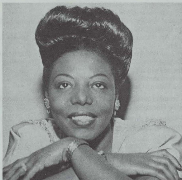
1945—Glamour photo of Mary Lou Williams taken in conjunction with an appearance at Cafe Society Uptown, N.Y.C.

highly influential in developing the style of music that became known as Kansas City Swing . Possessed of a strong, swinging left hand, Miss Williams first gained wide recognition for the power, as well as the musical subtlety, of her playing. It has often been said that "she plays like a man". Many men are complimented if they are told that they play like Mary Lou Williams. During the Swing Era, Miss Williams wrote and arranged for all the Big Bands including those of Kirk ( Walkin' and Swingin' , Mary's Idea , Froggy Bottom , Cloudy ), Benny Goodman ( Roll Em and Camel Hop ), Jimmie Lunceford ( What's Your Story Morning Glory ), the Dorseys, Cab Calloway, Glen Gray and the Casa Lomas, Louis Armstrong, and Duke Ellington ( Trumpet No End ).