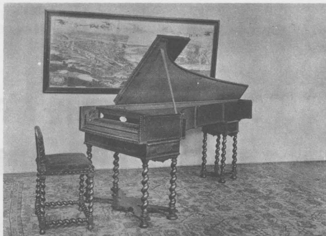
Grand clavichord made by Francesco Neri of Rimini (Italy) in the seventeenth century. City Museum, Prague.

Keyboard stringed instruments can be divided into two categories according to whether the strings are struck or plucked. The clavichord and the hammerclavier (as well as the piano) belong to the first category; the harpsichord belongs to the second.