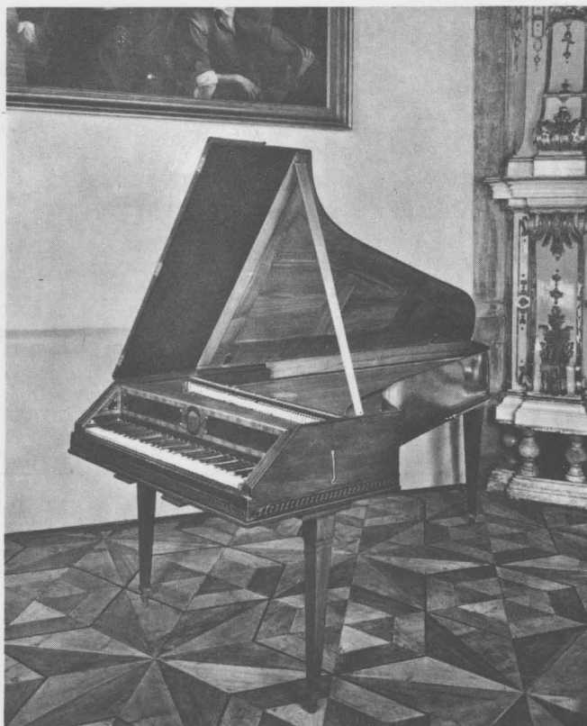
The eighteenth century Czech piano on which Wolfgang Amadeus Mozart played in January 1787 in the Ladies' College in Prague. National Museum, Prague.