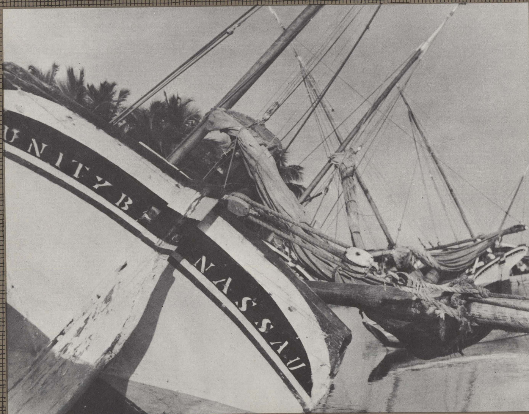
The Sloops at Lisbon Creek