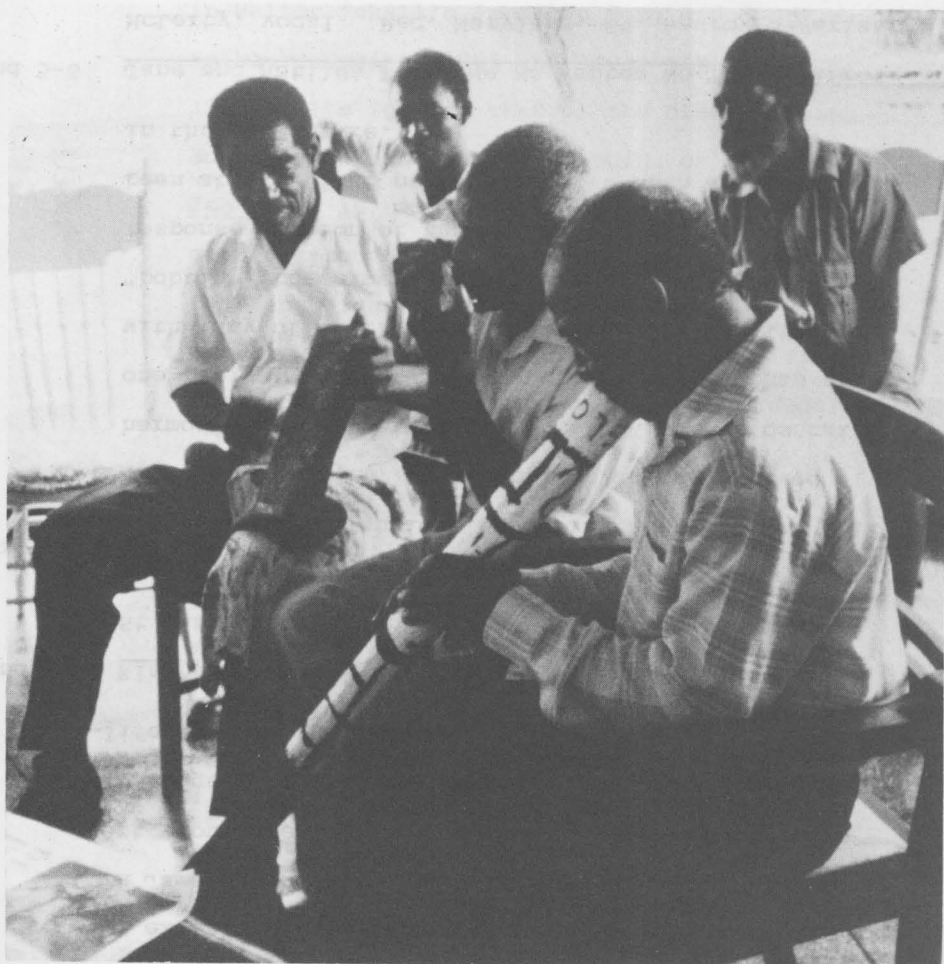
Jamaica Mento Group—Harmonica, Home-Made Bass, Trumpet and Coconut Grater as Scraper

The fact that this recording shows very strong European (and white American) ingredients is not the result of any revisionist selection process. It accurately reflects the nature of the music which we found wherever we went. If the results help correct the undue neglect of the tradition's British aspects that has replaced undue neglect of its African elements, so much the better. But that is secondary. Musical politics come and go. Despite all pressures, the music lives on: Afro-European in its roots, purely Jamaican in its fruits.