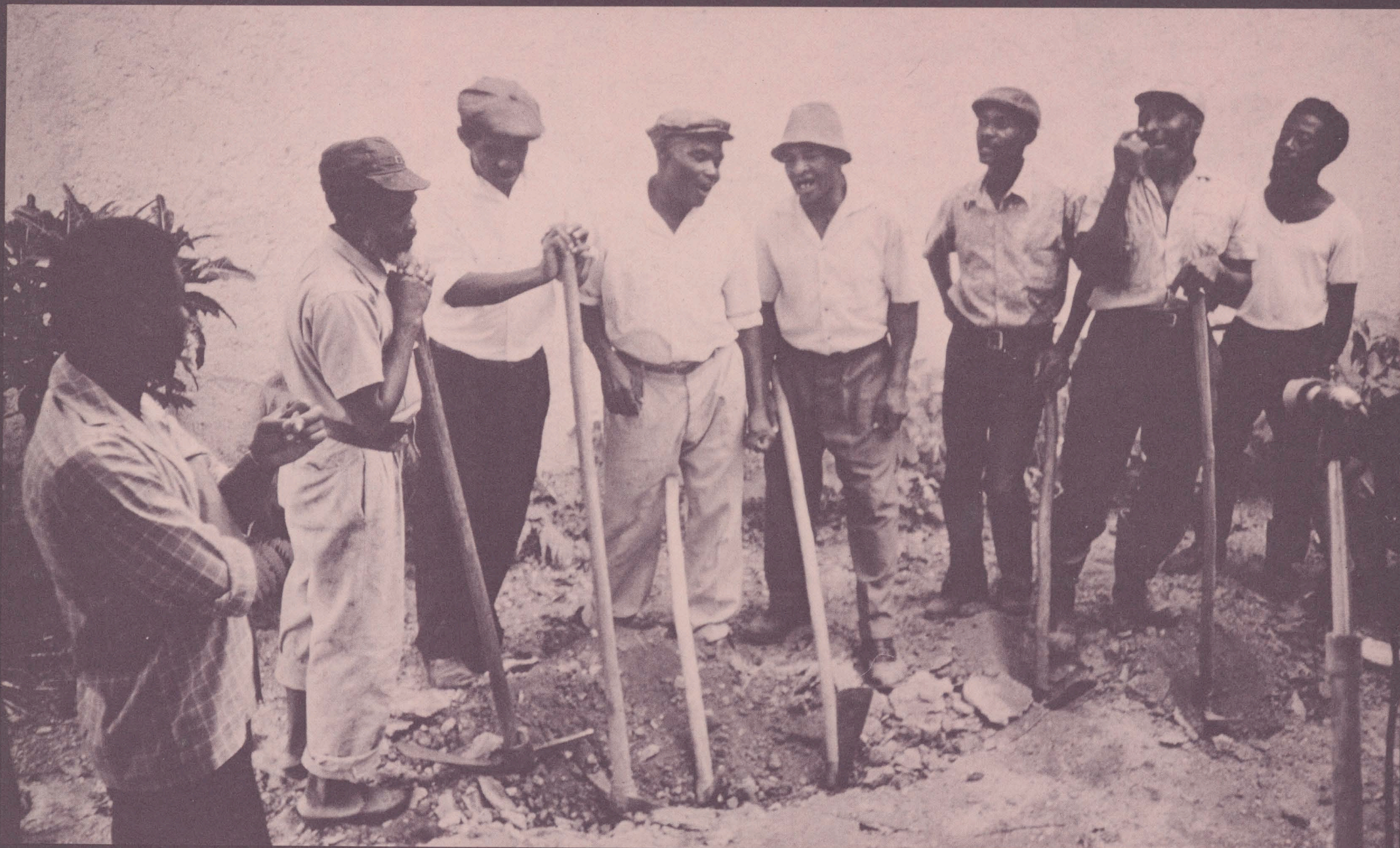
DIGGING SONG - SINGING THE BOBBIN TO KISANDER