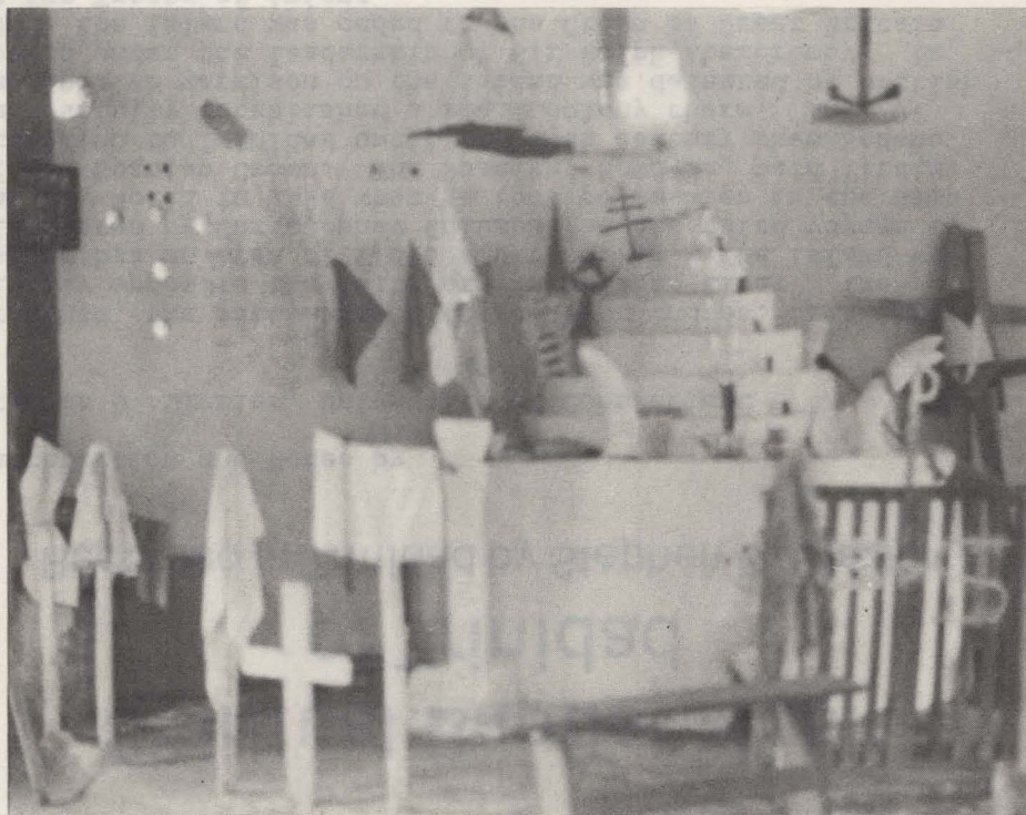
Baptist Altar, Los Lomas

Behavior during ceremonies varies considerably. Most leaders begin their services with elaborate rites of purification. Purification rites are intended to cast out evil spirits ("orisha") from the place of worship. Candles, located at all church openings, are thought to discourage evil spirits from entering the building while ceremonies are in progress and incense, bell ringing, and strewing of perfumed water serve to dispell those spirits already inside. Visitors and other unbaptized participants are believed to be most vulnerable to attack by evil spirits, and such individuals receive special attention. In Curepe, where a neighboring Pentecostal church specializes in demon exorcism, Baptist churches take special care in purification since it is believed that an abundance of recently exorcised spirits are looking for new hosts in the area.