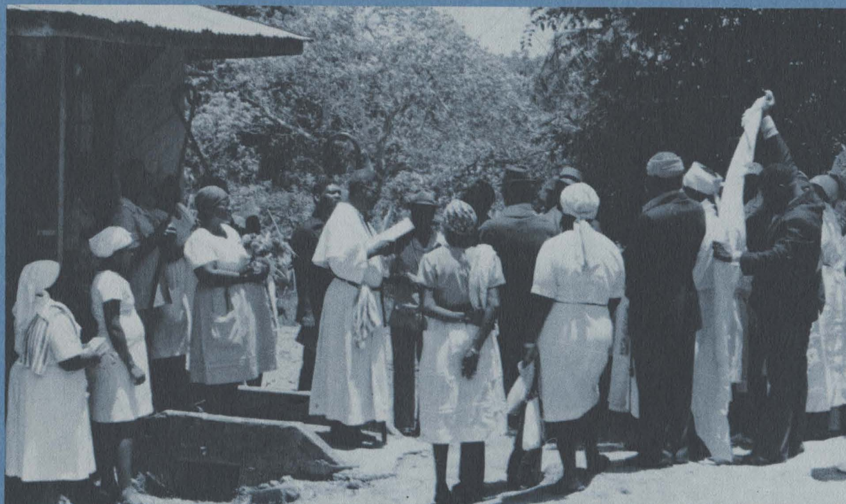
A JOINT WORSHIP SERVICE, MT. TABOR SPIRITUAL BAPTIST CHURCH, TODD'S ROAD