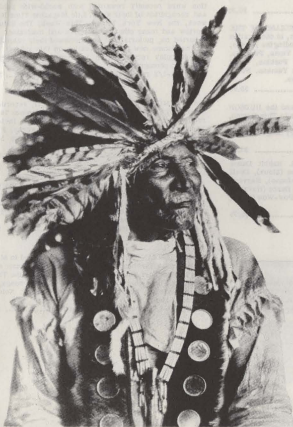
Brave Buffalo, medicine man of the Sioux