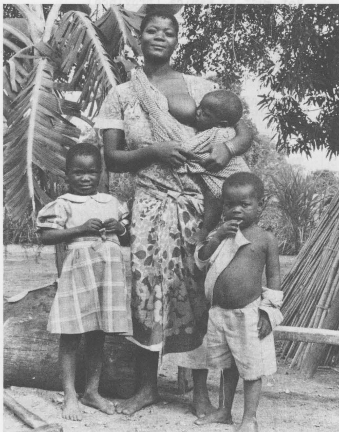
SIDE 2 Band 1

Makwayela Dance. Song about Chissano, the first Mozambican to take part in the transitional government in 1974, one year before the complete Independence of Mozambique.