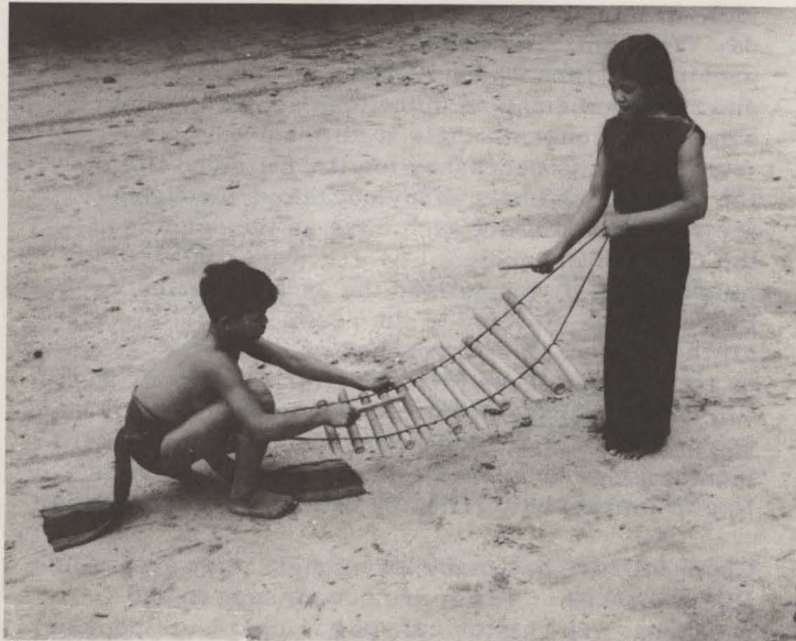
XYLOPHONE (HIGHLAND PEOPLE, CENTER VIETNAM)