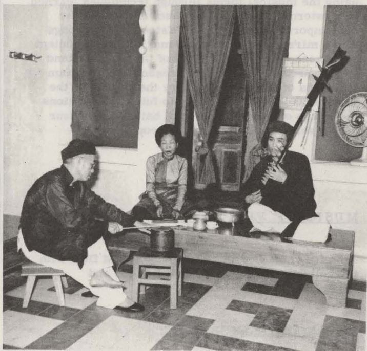
CHAMBER MUSIC (NORTH VIETNAM)