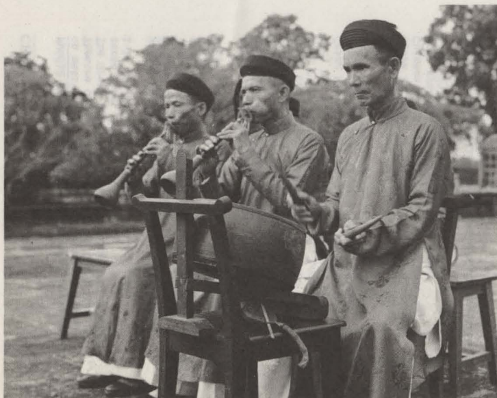
ORCHESTRA OF HUE (CENTER VIETNAM)

played with a southern melody takes the name of Co Ban Dung (Changed song).