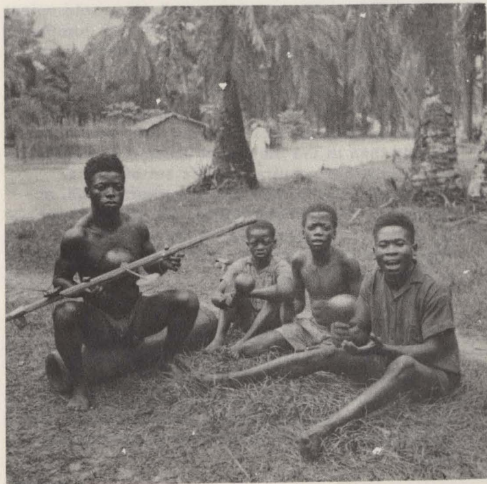
Kouyou musicians with zither-harp and rattles

Record 1425 B (2): YASWA MARIMBAS (three xylophones) -- The instruments, of very complex design, show that the people of this area are very familiar with accoustical principles. The calabashes placed under wooden keys of different sizes are chosen so that they may serve as resonators for the corresponding keys. Furthermore a small hole has been drilled into each gourd or calabash and covered with a film which acts as a reed-pipe. This results in a buzzing noise of which Africans are very fond. The musicians are professionals. They go to the neighboring festivities, two teams work in relays, from sunset until day-break; not one moment does the music stop, while men and women dance in circles round the three xylophones placed in a triangle.