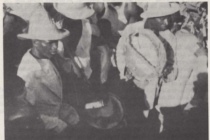
Congo Society Drummers