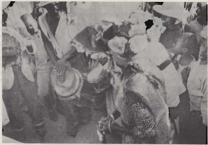
Congo Society Festival

Side II, Band 1-- MAININ'M ALLÉ: This is a secular piece of the type that may be heard at any of the non-religious Congo dances. The theme is common in Haitian musical literature - hui orous bravado. When the song originated, Borno was President of Haiti. The words say, in Haitian idiom, "Who's afraid of Borno?" As proof of his contempt for the highest authority in the country the singer demands to be confronted by the president himself: