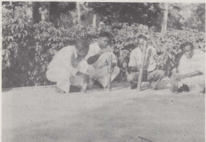
Playing the Gambos, or Bamboo Stamping Tubes