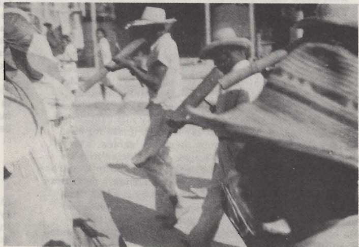
Playing the Vaccines, or Bamboo Trumpets