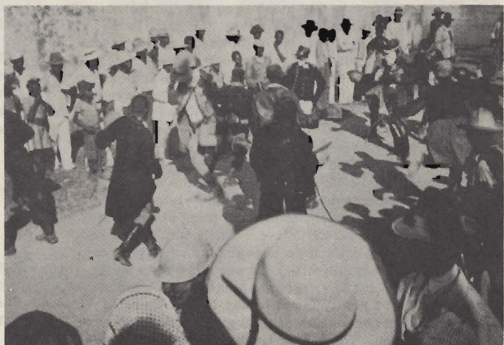
Comic Dance Team performing "Dance of the Generals"