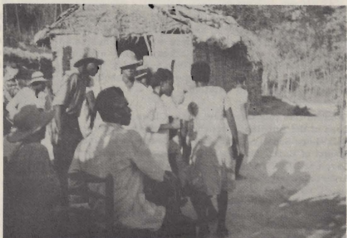
Afternoon IBO Dance