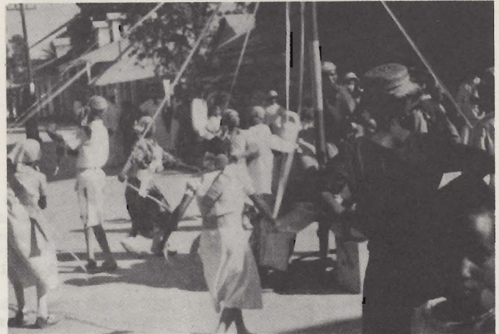
Maypole Dance ( men performers )

Side II, Band 2--MASCARON DANCE, played on two drums and a basse (large tamborine), with hands only. The deep insistent tones, sometimes in the form of a glissade, come from the basse. This is a secular festival dance, particularly common during such occasions as the pre-Easter Mardi Gras gatherings.