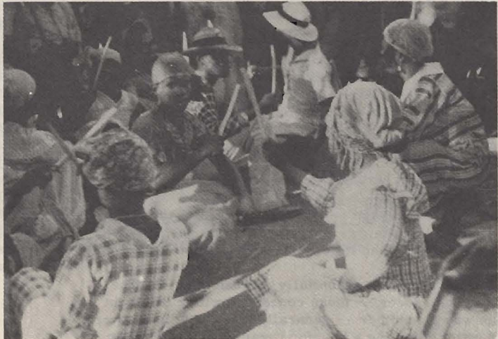
Haitian Stick Dancers

In addition, however, there is a vast body of secular music. It includes worksongs, playsongs, secret society music, songs of protest and ridicule, political songs, story songs, and otherwise unclassifiable social music, all stemming out of an essentially African tradition. Some ballads and lovesongs in the more common Latin-American idiom are also