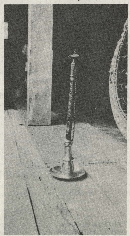
Pee Java (altc oboe)