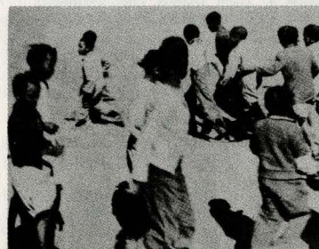
--RING GAME PLAY VARIANT OF ROSIE DARLING ROSIE

and many of the words appear as nonsense syllables whose precise meanings are not known to the children. Nevertheless, there is a basic continuity of traditional form. Most of the games are played either in a ring or a line. In the ring games, the children stand in a circle, often holding hands, with the leader either out- side or inside the circle performing some action. In the line games, two lines of players are formed with the leader between them or at the head of one. Both ring and line games usually have a formalized ending; a sequence of actions is carried through until all the children have participated. A game of the play-party type, on the other hand, may continue indefinitely. Hand- clapping is a component part of all these forms.