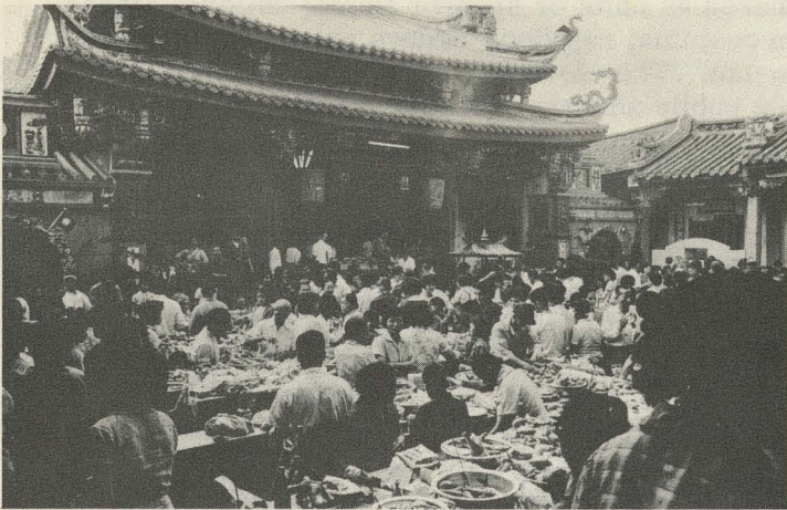
Taiwan-Chang Hua, Bai Bai Festival