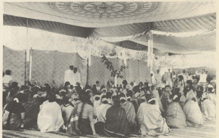
India-Bangalore, Hindu Wedding

This extremely brief excerpt comes from a traditional wedding service that takes the better part of a day to complete. The wedding party is seated in a small rectangular area either in a temple or in a tent in the temple yard. A sacred fire is kindled and a representation of a tree is erected. The prescribed ritual is conducted by two or more priests chanting consecutively. The texts are from the Vedas and recited in Sanskrit or an approximation of Sanskrit, depending on the training of the priest. His rote learning does not