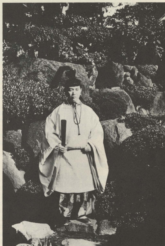
Japan-Osaka, Shinto Priest

Nowhere is the vitality of sectarian Shinto more evident than in this congregational chant in which they affirm their faith in the tenets of Konkokyo. The chant lasted for just over ten minutes. In the faces of the people one could see the intensity of their effort and the depth of their passion.