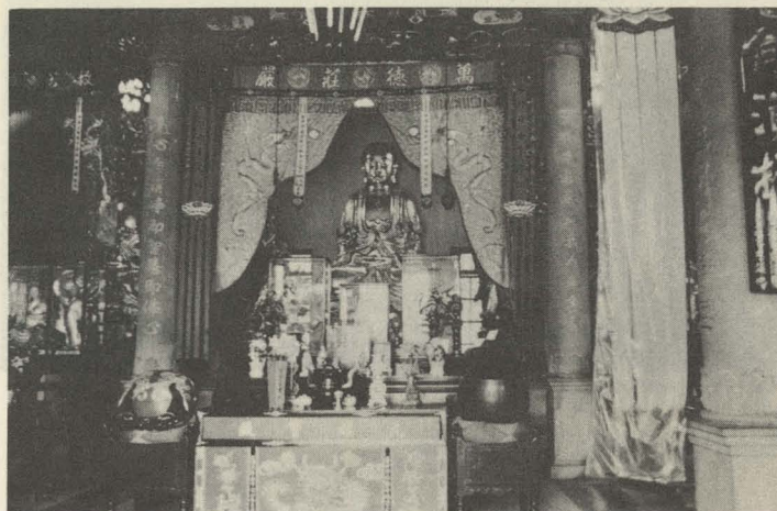
Taiwan-Taichung, Village Temple

march as units or sponsor floats; children march in costume; religious orders appear in their vestments. The electronic sound track and the portable public address systems are also in evidence.