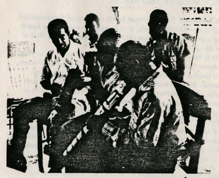
Jamaican mento band (see Band 15).

New World musicians often made basically European elements into something new by using African approaches, especially to rhythm. This West Indian drum-and-fife group had its parallels in Europe, and it is playing a movement of an old European ballroom dance, the quadrille. But the result is extremely un-European.