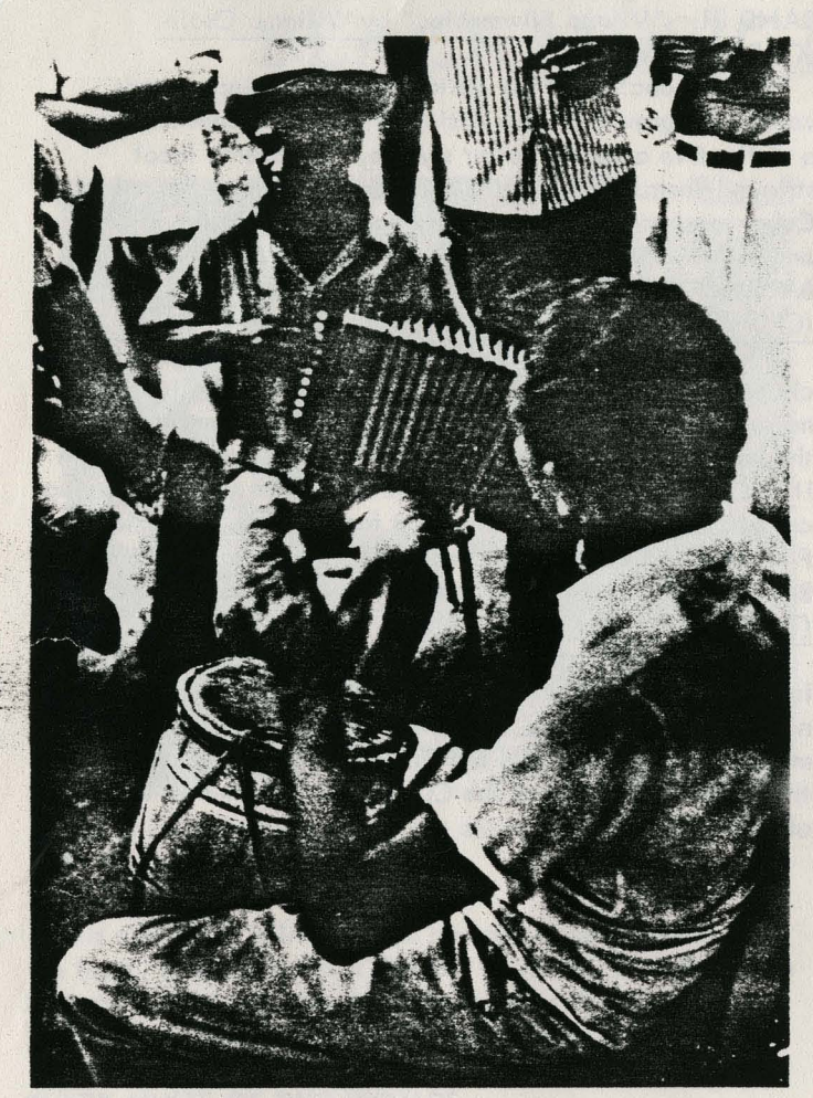
A Dominican Republic merengue group: accordion and tambora (see Band 16).

monica, a coconut grater, a wooden tuba made a branch of the "trumpet tree," and beerbottle persion. The rhythm of this piece is reminiscent of much anglish country dance music Jamaicanized.