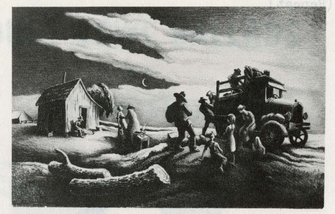
Benton's lithograph of dust bowl refugees packing to leave for the promise land.