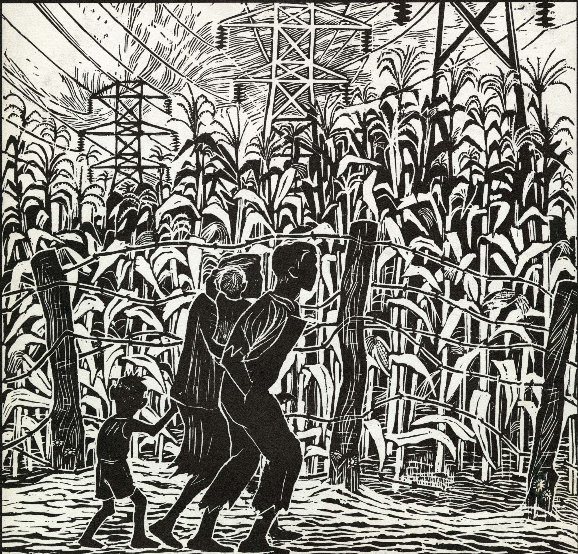
LAND OF PLENTY, BY LUCIENNE BLOCH

Sung by Pete Seeger Folkways Records FH 5233