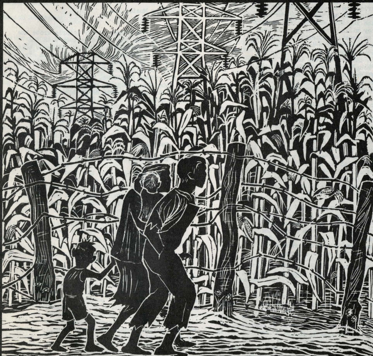
LAND OF PLenty, BY LUCIENNE BLOCH

Sung by Pete Seeger Folkways Records FH 5233