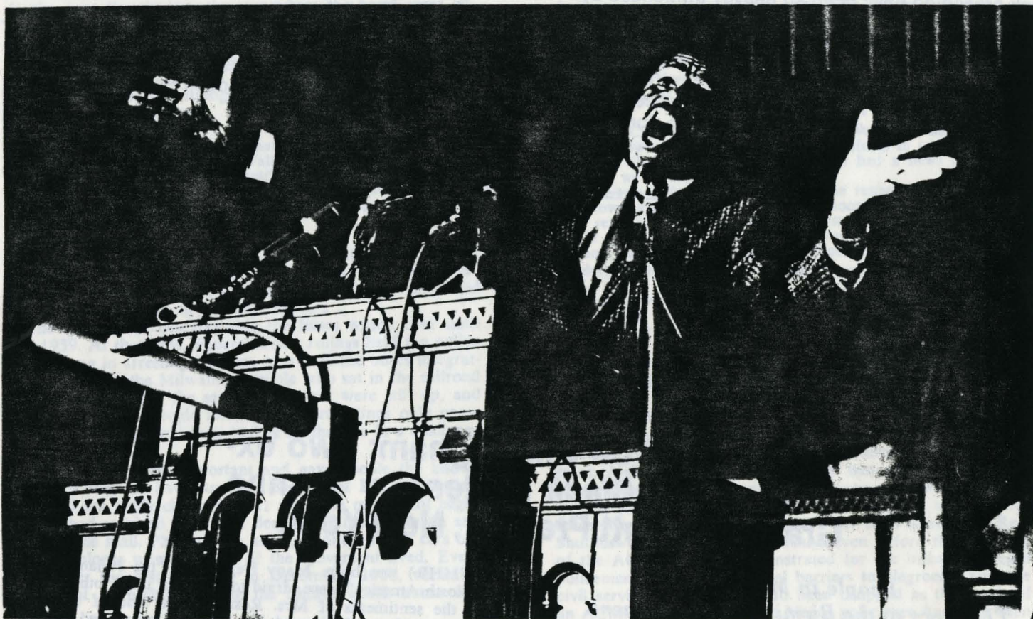
Rev. Fred Shuttlesworth, president of the Alabama Christian Movement for Human Rights, speaking at a mass meeting in Birmingham.