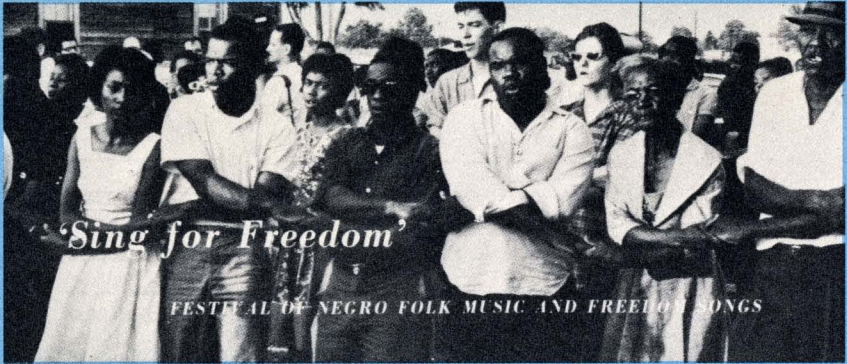
May 7-10, 1964 Gammon Theological Center Old Campus Atlanta, Georgia

Would you like to know more freedom songs and have better singing at your mass meetings and community gatherings? If so, please carefully choose one or two people in your group who are good at singing and song leading and will be able to learn something at this workshop and festival which they can use to help your organization and local movement.