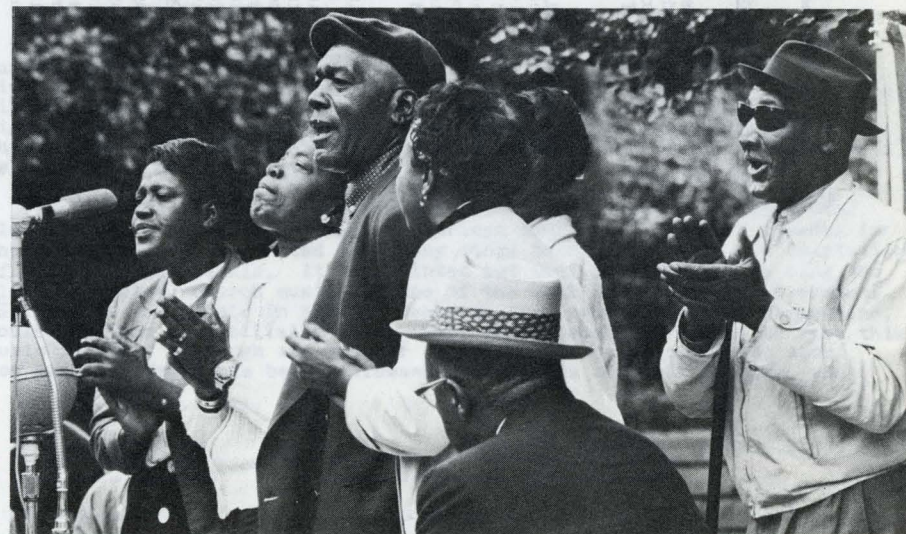
Georgia Sea Island Singers at Newport Folk Festival.

At the concert that night, the Sea Island Singers were the only group to receive a standing ovation. Many of the people who had come to Atlanta ashamed of their own vibrant tradition went away with a deepening sense of pride in it. A number left somewhat troubled, not convinced, but thinking.