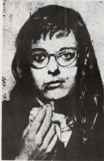
"A policeman swiped me with his club"