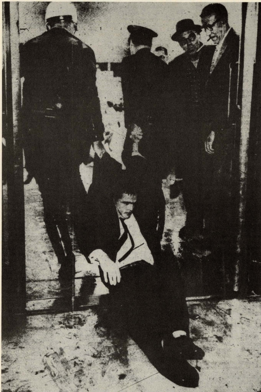
Two officers dragged young demonstrator out City Hall door; he was one of 64 persons taken to jails

Excerpts from the actual hearings, interviews outside the courtroom, and from eye-witness accounts