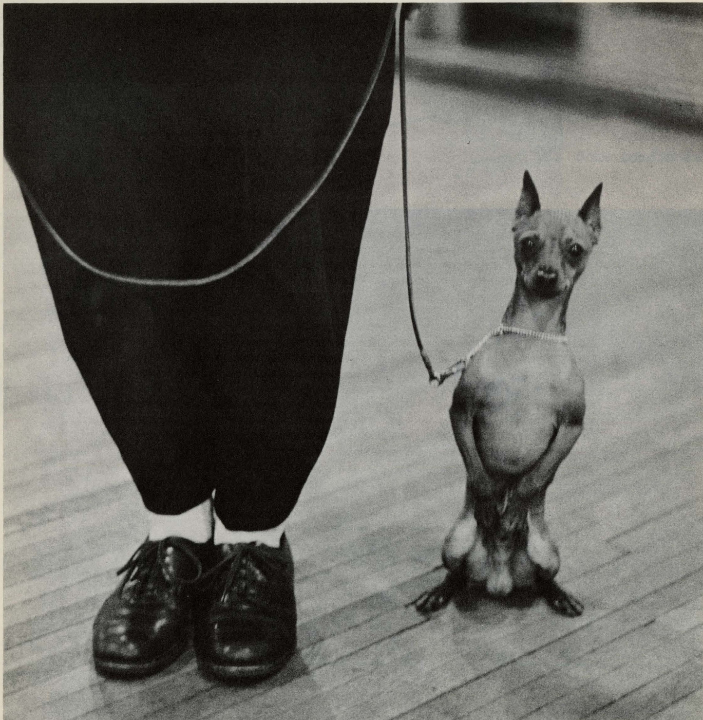
Another friend at school