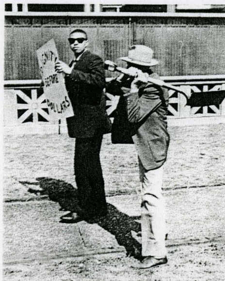
Picketing on Court House steps in Nashville.

--- all three are old spirituals but are used as theme songs in Nashville