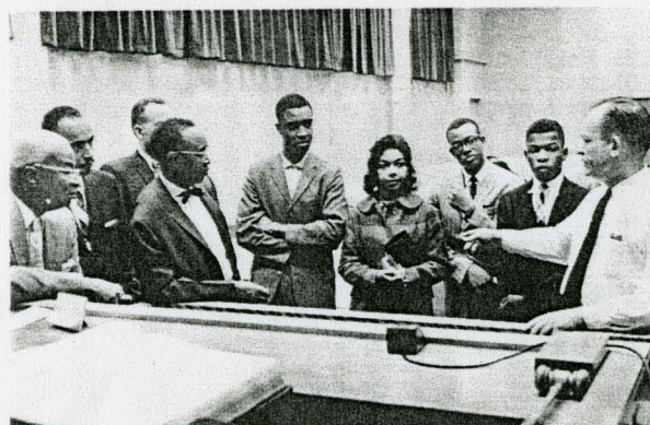
Court Room Scene : on left, defense attorneys middle, students; right, prosecuting attorney.