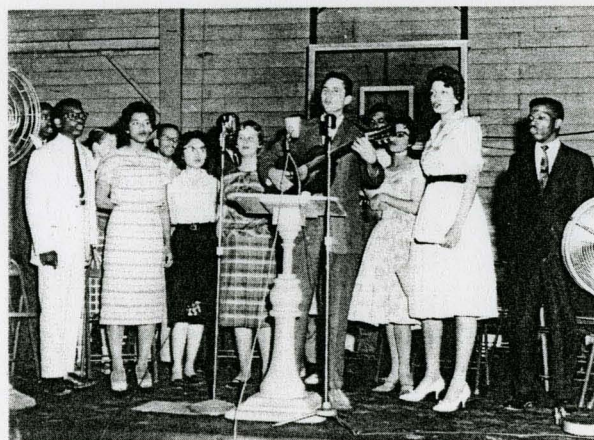
Students singing at a mass meeting