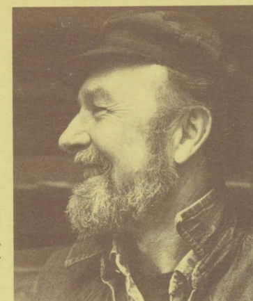
PETE SEEGER

With children's folk songs sung by Pete Seeger in concert