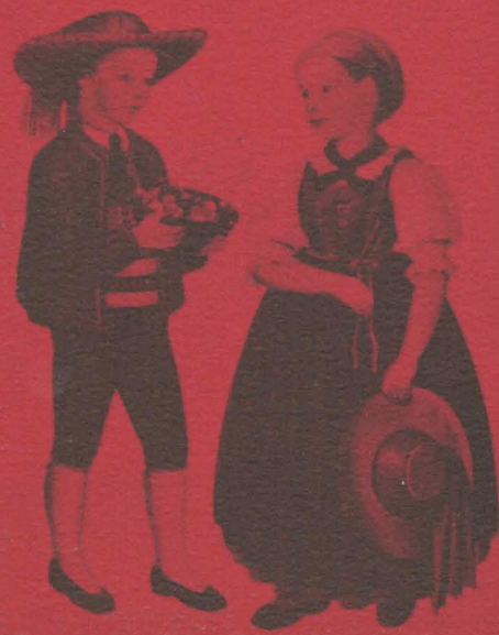
St. Leonhard — St. Leonhard — St. Leonhard