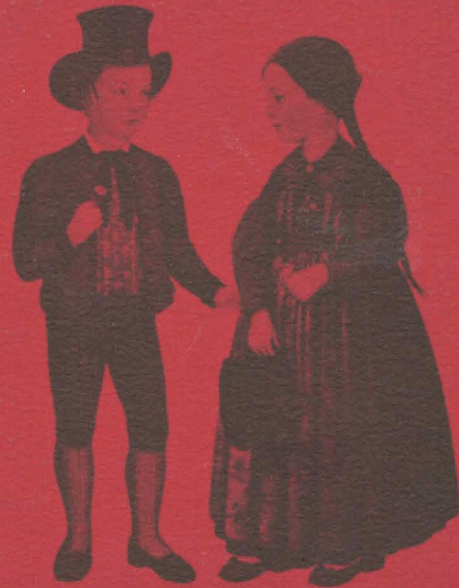
Lambach — Lambach — Lambach