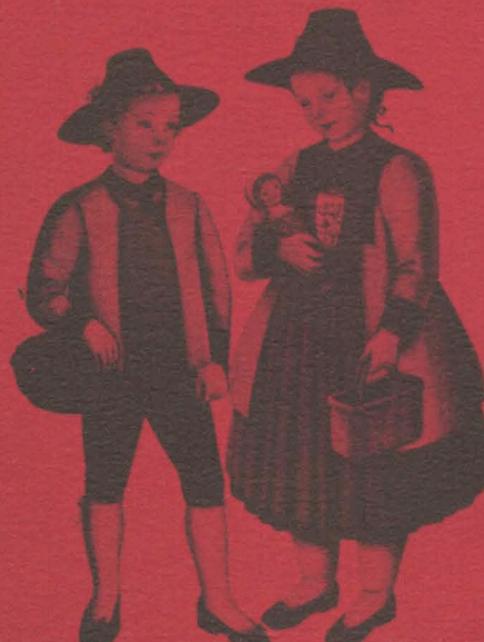
St. Leonhard — St. Leonhard — St. Leonhard