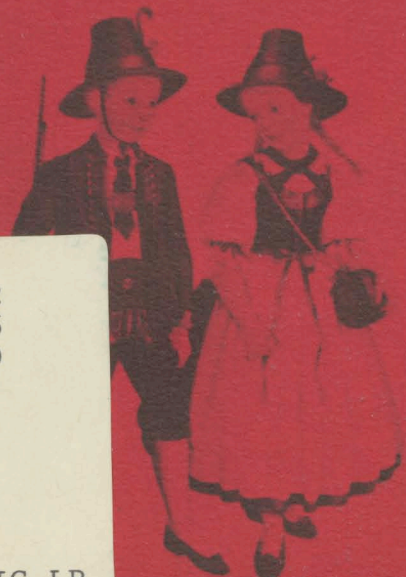
St. Leonhard — St. Leonhard — St. Leonhard