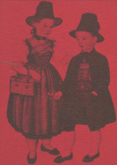
Bozendorf — Bozendorf — Le Bozendorf