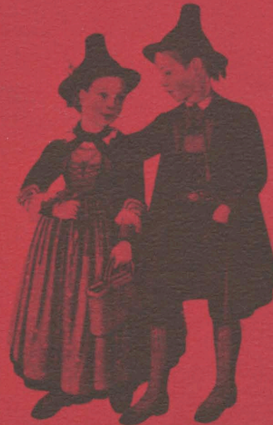
Lienz — Lienz — Lienz