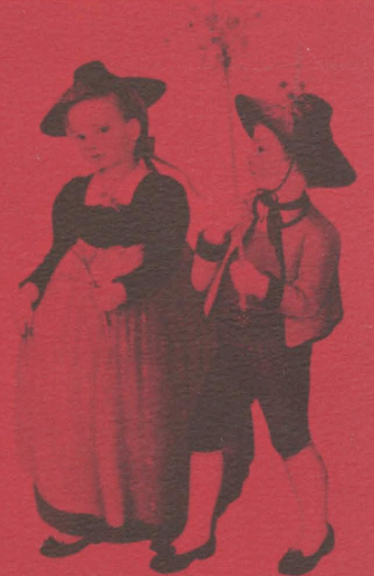
St. Leonhard — St. Leonhard — St. Leonhard