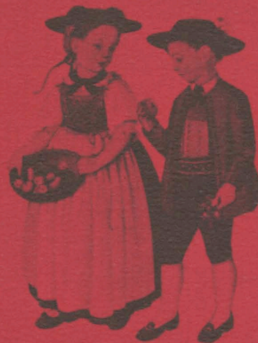
St. Leonhard — St. Leonhard — St. Leonhard