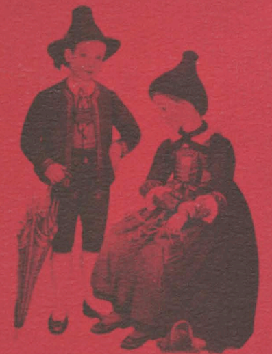
St. Leonhard — St. Leonhard — St. Leonhard