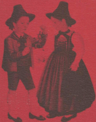
St. Leonhard — St. Leonhard — St. Leonhard