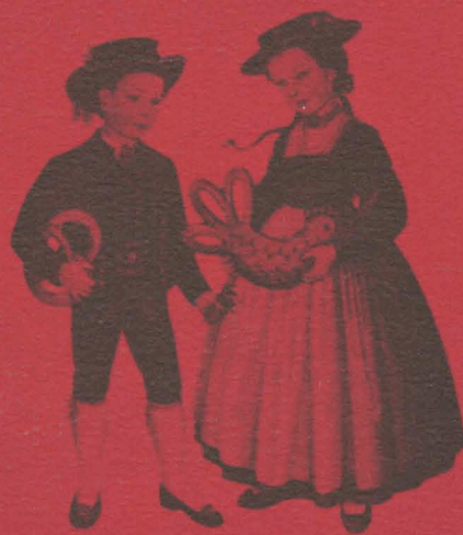
St. Leonhard — St. Leonhard — St. Leonhard