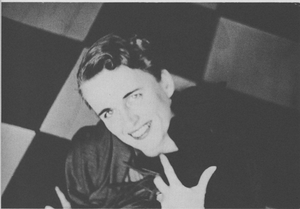
in San Francisco, 1955