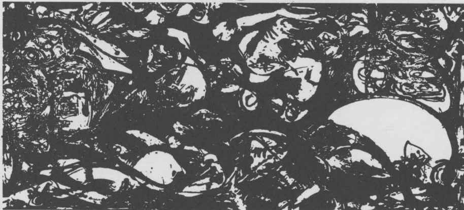
PAINTING "NO. 11" BY JACKSON POLLOCK