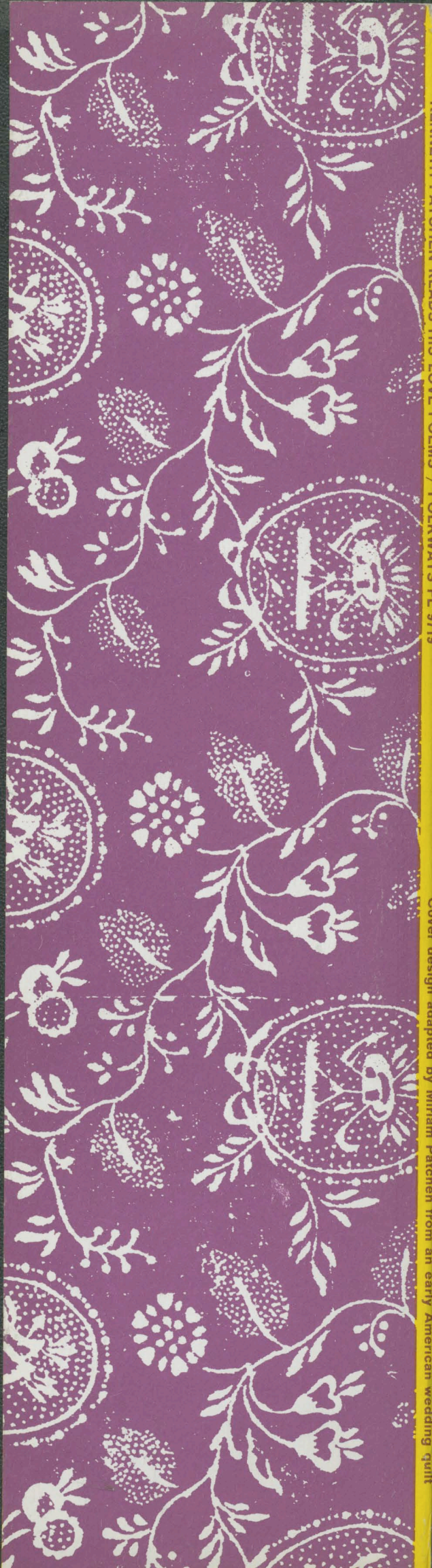
Cover design adapted by Miriam Patchen from an early American wedding quilt