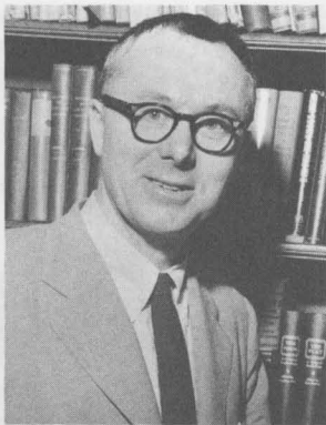
ERIC BENTLEY

Eric Bentley (adaptor, narrator) has adapted more than a dozen Brecht works which have been produced all over the English speaking world. He is also General Editor of the Grove Press Edition of Brecht (ten volumes so far), and has made the following Brecht record albums for Folkways: Bentley on Brecht (FH 5434), Songs of Hanns Eisler (FH 5433), and Brecht Before the Unamerican Activities Committee (FH 5531). Spoken Arts has issued the original cast album of the Brecht-Bentley A Man's A Man (SA 870).