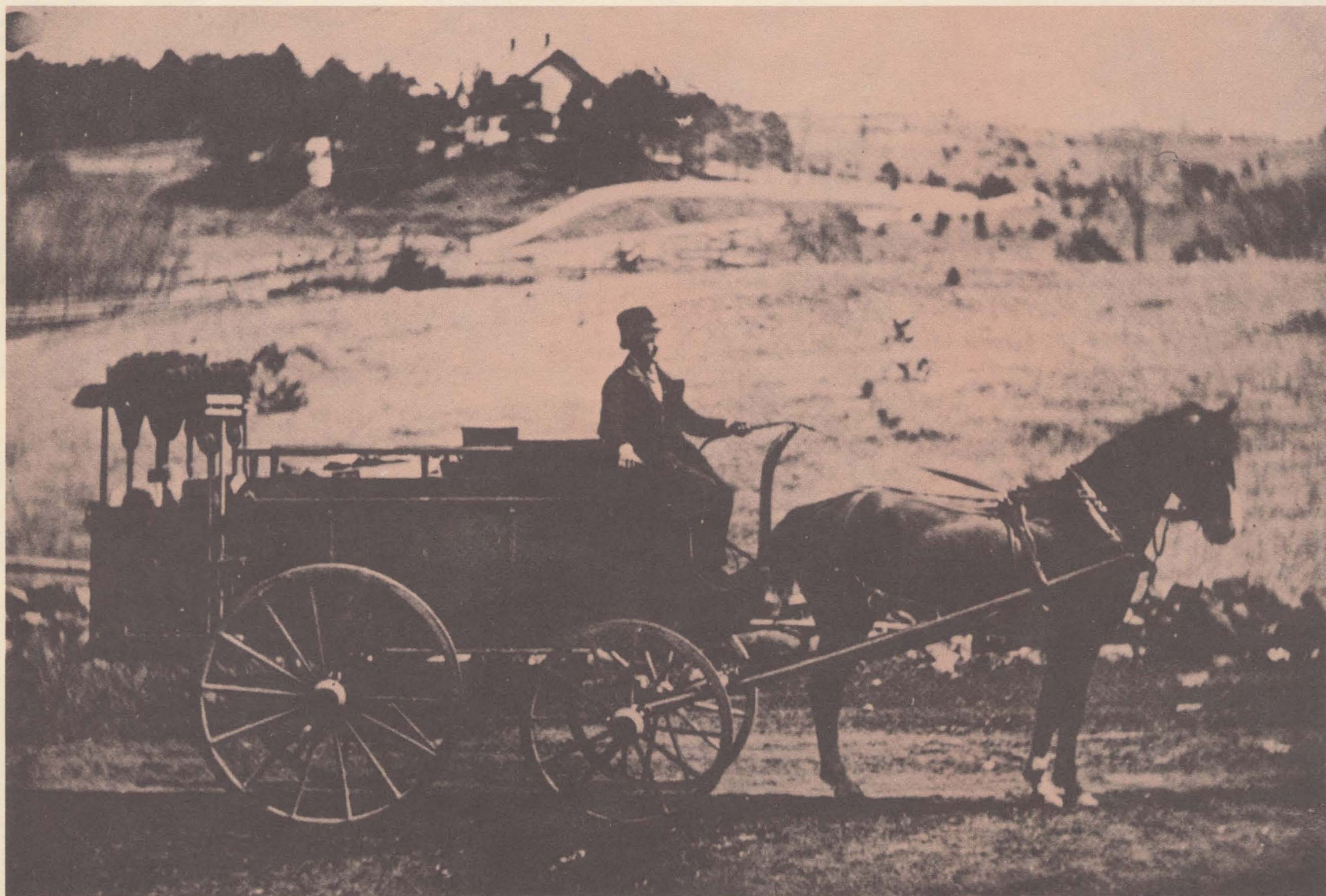
THE PEDDLER, PHOTOGRAPH 1850

A collection of early Colonial Songs sung by Jim Douglas