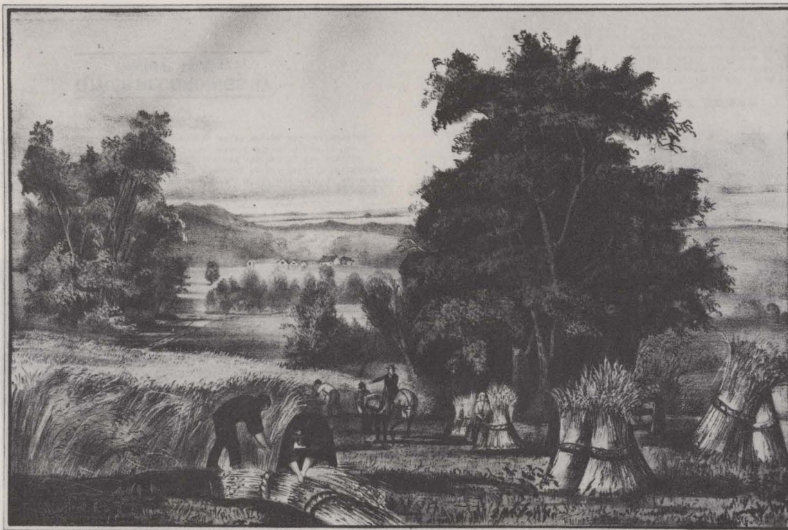
THE WHEAT FIELD.

The opening page of Gram's "Bind Kings" indicates the extreme vocal disposition he requires: double trebles and double tenors along with the usual bass and alto (counter-tenor). Also note his patch-work layout, doubtless intended to allow the printer to make maximum use of each sheet of music.