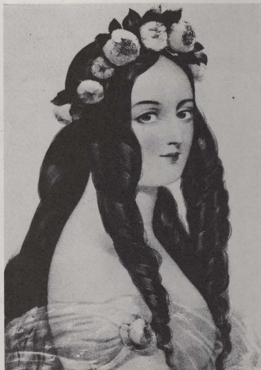
THE MAY QUEEN.