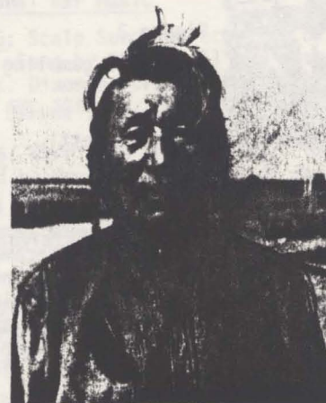
Figure 2. Spumiapi, 1939. By F. Gully. Courtesy of Jane R. Hanks.

Indian languages spoken in the Midwest and the Northeastern United States. When first encountered by whites in the eighteenth century, the Blackfoot were nomadic, dividing into bands during the winter and coming together in the summer. Before the coming of horses they used dogs to pull their belongings while traveling; horses, acquired from tribes to the West, made possible much faster and efficient movement, and therefore the reliance on the buffalo for almost all aspects of livelihood increased in the eighteenth and nineteenth centuries. Warfare for substantive as well as ceremonial purposes (i.e., for the expansion of hunting grounds as well as to show courage by touching an enemy or stealing his horse) was highly developed. Religion centered around a complex of medicine bundles--groups of objects with supernatural power acquired through instructions