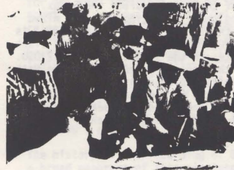
Figure 4. Blackfoot singing group, 1966. Courtesy B. Nettl. By Bruno Nettl.

As far as we know, the Blackfoot used only drums and rattles, and most of the recordings include drumming. "Flutes," probably flageolets, are mentioned by older individuals but seem to have been little used in the last 100 years, if ever. Like most American Indian repertoires of the United States and Canada, that of the Blackfoot is essentially vocal.