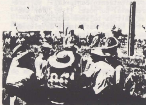
Figure 3. Blackfoot gambling game, 1966. Courtesy B. Nettl. By Bruno Nettl.

less, the collections of Grinnell, Wissler, and Dixon provide some insight into what Blackfoot music must have been like in the late nineteenth century, before the Indians had come into intensive contact with whites and their music. Many of the songs are sung by older individuals who provide us with a record of music demonstrably a century old.