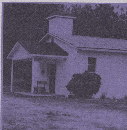
SMITH GROVE BAPTIST, GARDI