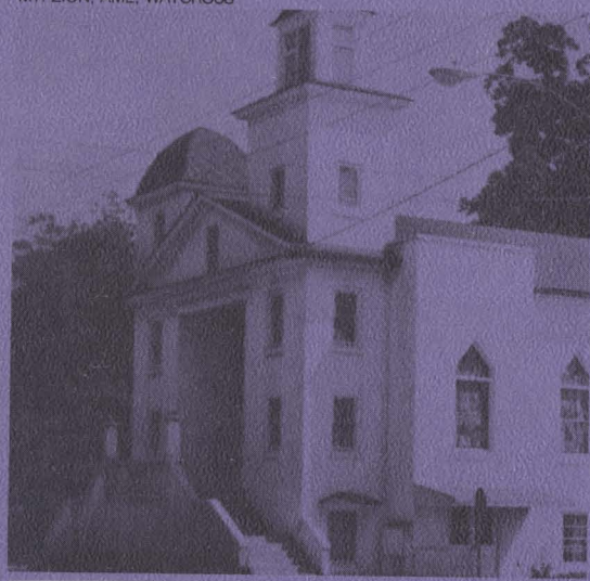
MT. ZION, AME, WAYCROSS