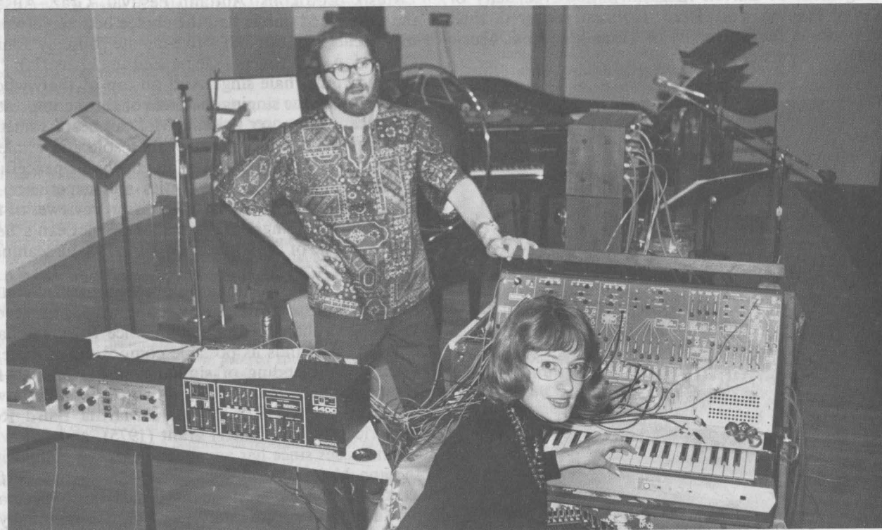
The McLean Mix on tour.