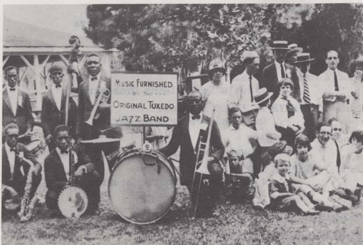
THE ORIGINAL TUXEDO JAZZ BAND, 1923