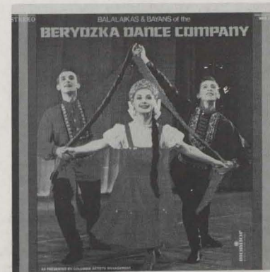
MFS 742 BERYOZKA DANCE COMPANY

"Captivating" . . . "Charming" . . . "Lyrical" . . . "Graceful" . . . these were the words most frequently used by American critics and audiences in describing the creative choreography of the Beryozka Russian Dancers during their visit to the U. S. in 1959. The Beryozka Dancers, an all-female group formed at an amateur folk dance festival in Moscow a decade ago, take their name from the Beryozka Reel, their most popular and enchanting dance. (Side 2, No. 1) Beryozka is the Russian for birch tree and traditionally symbolizes youth and spring, qualities which pervade most of the group's dances. One critic described their opening night this way: ". . . the Beryozka Russian dance company brought both charm and excitement. The charm exuded naturally from the freshness and vivacity of the all-girl troupe; the excitement came from the fluidity and precision of their movements." (Miles Kastendieck in the N. Y. Journal-American.)