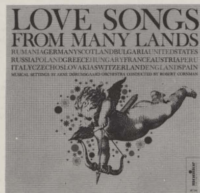
MF 346 LOVE SONGS FROM MANY LANDS