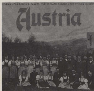
MF(S) 341 AUSTRIA: STYRIAN FOLK SONGS AND DANCES

Cover Design: David Chasman For the care of your records check needle periodically; store away from heat; wipe with a damp cloth before playing. For playback on wide-range equipment use RIAA curve. Printed in U. S. A.