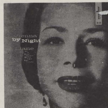
MP 510 LIANE: VIENNA BY NIGHT