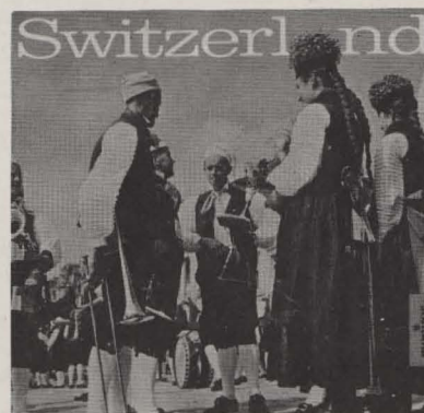
MF(S) 353 SWITZERLAND: SCHOTTISCHES, LANDLER, WALTZES AND POLKAS