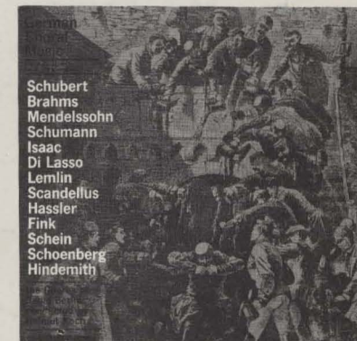
MC 2047 GERMAN CHORAL MUSIC — 16th to 20th Centuries