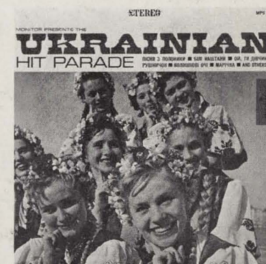
MP 604 UKRAINIAN HIT PARADE . Pisnia Z Polonyny; Rushnychak; My Pidem, De Travy Pokhylli; Bili Kashtany; Hai Shumliat; Valoshkovi Ochi, Oi, Ty Divchyno; Solov'nyi Romans; Marichka; Ty Liubov Moia; Ne Shumy, Kalynon'ko; Chaika Letyt' nad Vodou. Stereo: MFS 604.