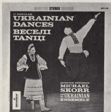
MF 446 17 POPULAR UKRAINIAN DANCES: Hopak, Harbuz Biley, Zaporozhietz, Sivanka, Arkan, Kolomeyka, Horlytsia, Kozatchok, Hrechanyky, Kolomeyka, Hopak, Two-Step, Kateryna, Hutzulka, Kolomeyka, "Marusia" Polka, Chumak. Stereo: MFS 446.