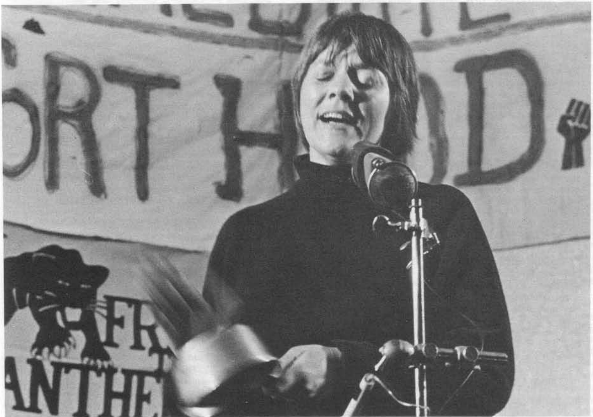
Barbara Dane at The Oleo Strut, Fort Hood, Texas