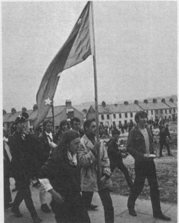
Bernadette Devlin and Bogside demonstrators

Text of a speech by Bernadette Devlin delivered at Oregon State University, Corvallis, Oregon, during her tour of the United States in the spring of 1971. (From the Grass Roots Forum )